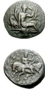
Fig. 17. BC Gortyn, AE denomination (4.99 gr., 18 mm), c. 250-221 BC: Classical Numismatic Group Inc., Mail Bid Sale 76, 12.09.2007, lot 614.