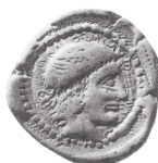
Fig. 5. Phaestos, AR stater (12,04 gr.), c. 380 BC: Le Rider, 1966: pl. xx, 23.