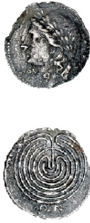
Fig. 26. Knossos AR tetradrachm (13.62 gr.), end of 2 nd c. BC, Stack's, Ancient & World Coin Auction January 2007, 15.01.2007, lot 4098.