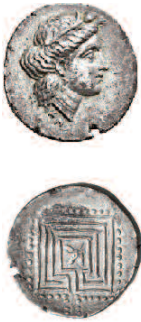
Fig. 22. Knossos AR stater (10.84 gr.), ca. 300-280/70 BC. Hess Divo AG, Auction 335, 06.12.2018, lot 43.