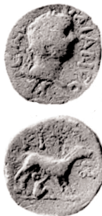
Fig. 35. Kydonia, AE Denomination (19 mm.). Traian. AD 98-117. Svoronos, 1890: pl. x, 26.