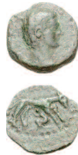
Fig. 34. Kydonia, AE Denomination (7.18 gr, 18 mm, 12 h). Nero. AD 54-68. Classical Numismatic Group, Inc., Mail Bid Sale 78, 14.05.2008, lot 1258.