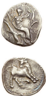
Fig. 12. Gortyn, AR stater (11.25 gr.), c. 300-280/70 BC: Ira & Larry Goldberg Coins & Collectibles, Inc. Auction 96, 14.02.2017, lot 1674.