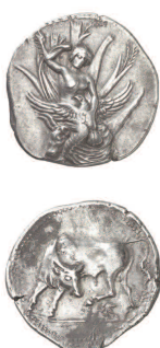
Fig. 13. Gortyn, AR stater (11.22 gr.), c. 300-280/70: LHS Numismatics 100, 23.04.2007, lot 276.