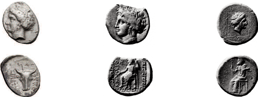
Fig. 19a-c. Knossos AR staters: