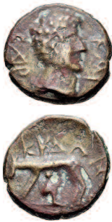
Fig. 33. Kydonia, Æ Denomination (4.52 gr, 17 mm, 7 h). Tiberius. AD 14-37. Classical Numismatic Group, Inc. Electronic Auction 351, 20.05.2015, lot 486.