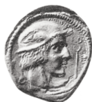
Fig. 4. Gortyn, AR stater (11,82 gr.), c. 380 BC: Le Rider, 1966: pl. xi, 10.