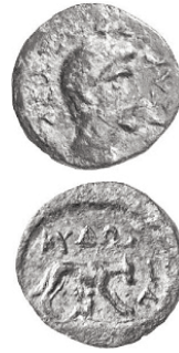
Fig. 32. Kydonia, AE Denomination (5,90 gr). Augustus, 27 BC-AD 14. Dr. Busso Peus Nachfolger, Auction 366, 29.10.2000, lot 469.