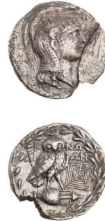
Fig. 27. Knossos AR pseudo-Athenian AR tetradrachm (14.62 gr.), ca. 87/6-67 BC. ANS 1944.100.40384 ( http://numismatics.org/collection/1944.100.40384?lang=el ).