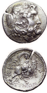
Fig. 16. Gortyn, AR Drachm (5.19 gr.), c. 250-230 BC: Roma Numismatics Ltd, Auction 7, 22.03.2014, lot 498.