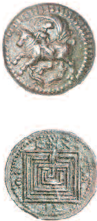
Fig. 24. Knossos and Gortyn AE denomination (4.52 gr) ca 220(?). Fritz Rudolf Künker GmbH & Co. KG, Auction 124, 16.03.2007, lot 7981.