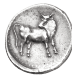
Fig. 7. Gortyn, AR stater (11.67 gr.), c. 360/50-340/30 BC: Künker 136, 10.03.2008, 67.