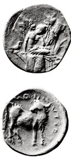
Fig. 11. Gortyn, AR stater (11,44 gr.), c. 322-300 BC: Le Rider, 1966: pl. xvi, 15.