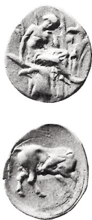
Fig. 10. Gortyn, AR stater (12,06 gr.), c. 322-300 BC: Le Rider, 1966: pl. xviii, 15.