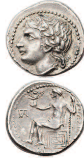
Fig. 21. Knossos AR drachm (4.88 gr.), ca. 300-280/70 BC, Heritage Auctions, Inc., Auction 3056, 03.08.2017, lot 30060.