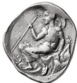
Fig. 6. Phaestos, AR stater (12.05 gr.), c. 360-350 BC: Leu Numismatik AG Auction 81, 16.05.2001, lot 234.