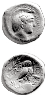
Fig. 29. Kydonia, AR pseudo-Athenian tetradrachm (15,37 gr.), ca 87/6-67 BC. Stefanakis, 1997: no 348.