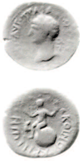
Fig. 31. Koinon of Crete, AE Denomination (5.61 gr., 25 mm). Trajan. ca. AD 115(?), RPC III, 35.