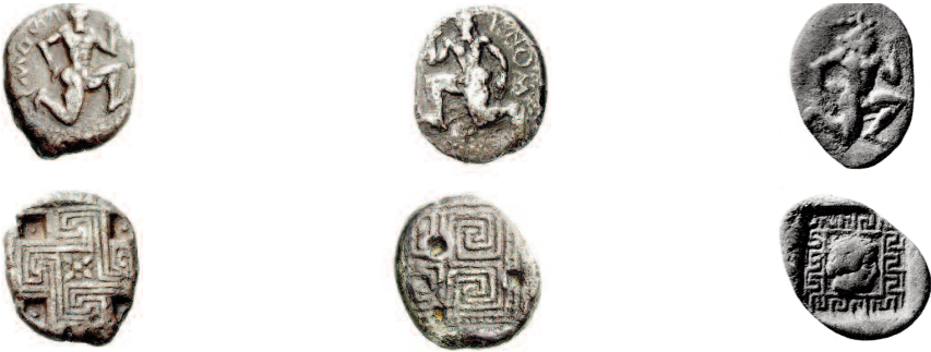
Fig. 18a-c. Knossos AR staters: