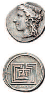
Fig. 23. Knossos AR drachm (5.41 gr.), ca. 300-280/70 BC, Numismatica Ars Classica NAC AG, Auction 114, 06.05.2019, lot 212.