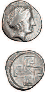
Fig. 20. Knossos AR stater (10.72g.), ca. 320-300 BC, Harlan J. Berk Ltd., Buy or Bid Sale 208, 05.09.2019, lot 226.