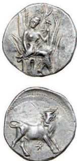
Fig. 14. Gortyn, AR stater (11.76 gr.), c. 300-280/70 BC