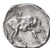
Fig. 9. Gortyn, AR stater (11.72 gr.), c. 300-280/70 BC: Nomos, Auction 18, 05.05.2019 lot 130.