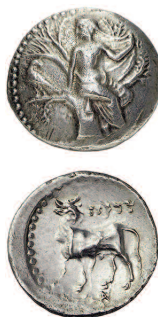
Fig. 15. Gortyn, debased AR stater (6.77 gr.), c. 260-250 BC: Gorny and Mosch Giessener Muenzhandlung, Auction 236, 07.03.2016, lot 207.