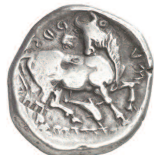
Fig. 8. Sybritos, AR stater (11,98 gr.), c. 360/50-340/30 BC: LHS Numismatics 100, 23.04.2007, 281.