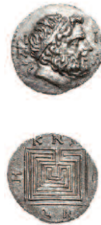
Fig. 25. Knossos AR tetradrachm (15.39 gr.), end of 2 nd c. BC, Ira & Larry Goldberg Coins & Collectibles, Inc. Auction 96, 14.02.2017, lot 1676.