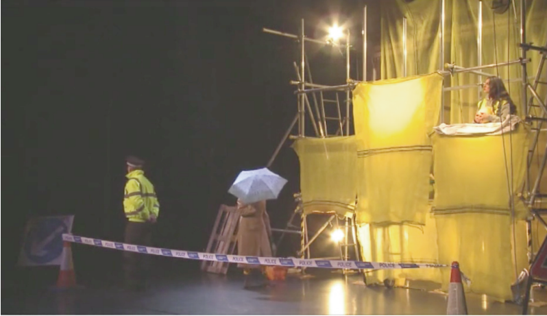
Picture II. First seconds of Lysistrata 's representation.

Retrieved from the stage version available at https://vimeo.com/402257276 (11.10.2022).