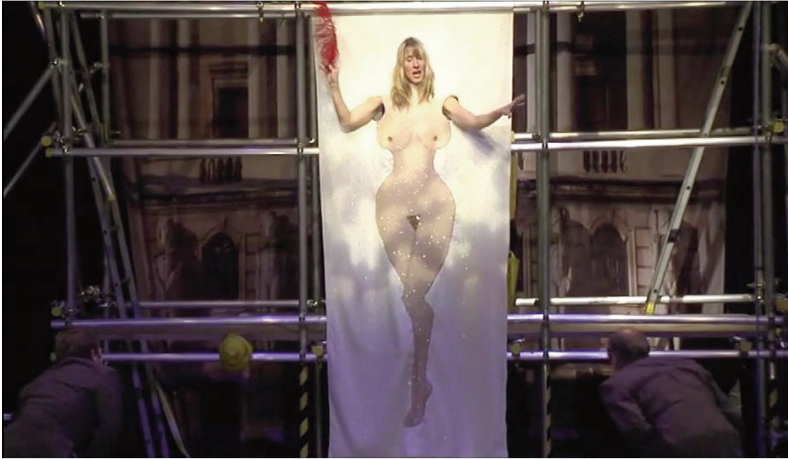
Picture IV. In this image it can be seen how Molly Fication is talking in the moment in which the peace deal between Athens and Sparta is being struck.