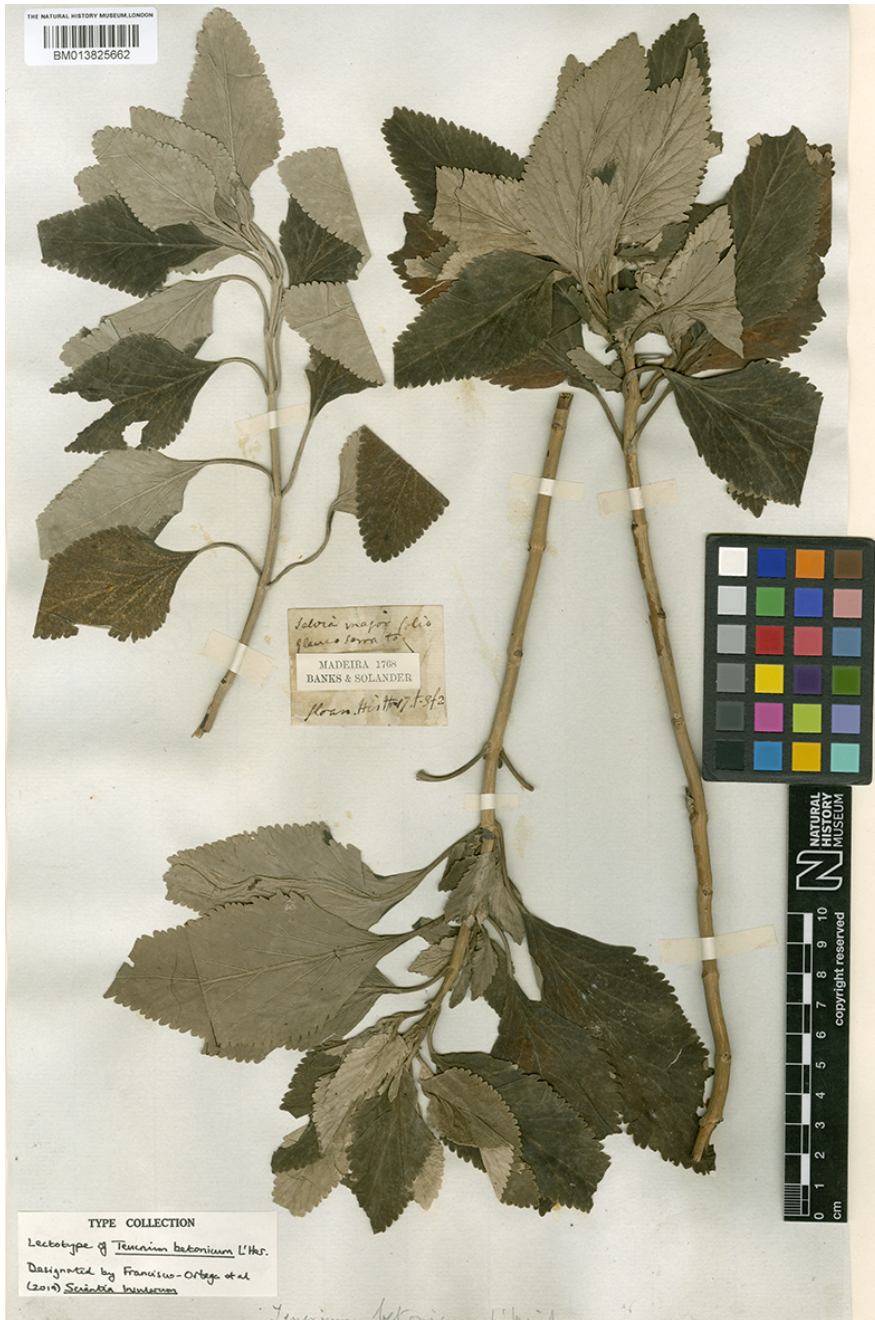
Figure 5. Herbarium specimen of Teucrium betonicifolium collected by Banks and Solander in Madeira during the Endeavour voyage. This is the lectotype of T. betonicum L'Hér., as designated by Francisco-Ortega et al. (2020).