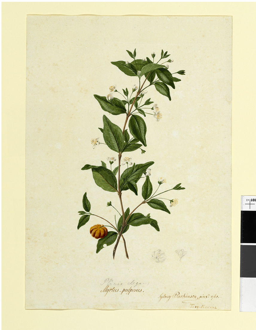
Figure 1. Watercolor of Eugenia uniflora made by Sydney Parkinson in 1768, based of material recorded in Madeira during the Endeavour voyage.

In this paper we present a study based on the manuscript that includes the list of Madeiran plants that Banks recorded in his two-volume expedition journal housed at the State Library of New South Wales, Australia [available online in https://www.sl.nsw.gov.au/banks/section-02/series-03/03-01-volume-1-joseph-