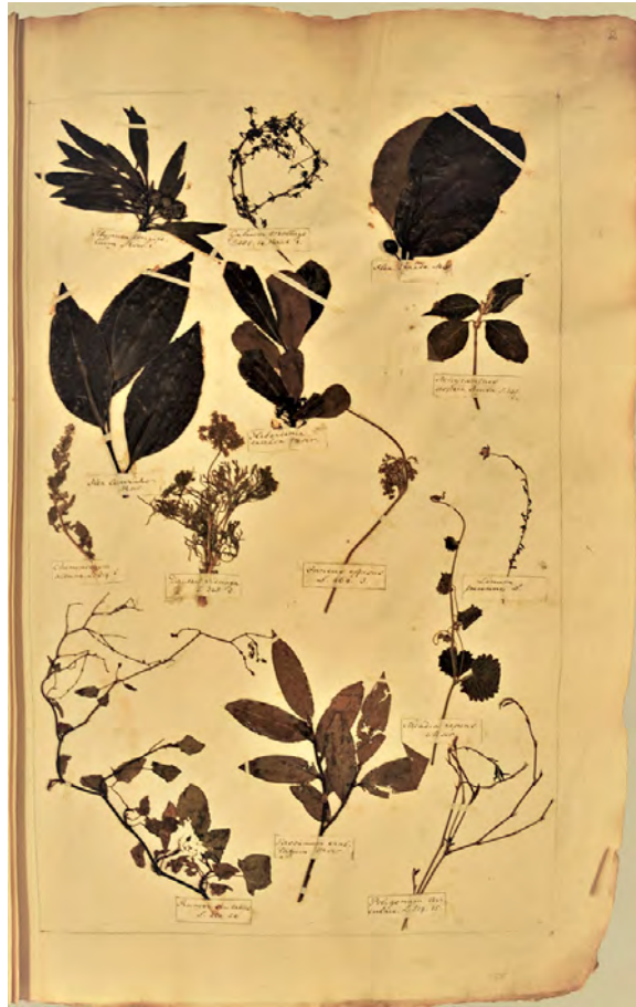
Figure 6. Sheet with specimens collected by Banks and Solander in Madeira that is part of a bound volume (folio 2) entitled Plants of Cook's First Voyage 1768-1771 held in the Historical Collections Room of the Natural History Museum of London. Specimens are identified (left to right) as follows: Top row: Globularia salicina , Galium productum , Ilex perado perado subsp. Second row from top: Ilex canariensis , Heberdenia bahamensis , Achyranthes sicula . Third row from top: Chenopodium album , Ammi visnaga , Juncus effusus , Linum bienne . Bottom row: Rumex maderensis , Vaccinium padifolium , Sibthorpia peregrina , Polygonum aviculare .

Image copyright of the Natural History Museum of London.