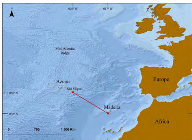
Figure 1. Location of the five socially related short-finned pilot whales ( Delphinidae ) photographed in the Azores and Madeira (solid circles). In the Azores, these animals were captured only twice during June 2015 at south of São Miguel Island. Whereas in Madeira, they were sighted regularly throughout the year between 2003 and 2015 mainly at south of Madeira Island. While the one-way distance covered at least 1000 km and lasted a maximum of 49 days, the round-trip movement (min. 2000 km) lasted a maximum of 4.5 months.

The straight line is merely indicative of the minimum migratory pathway.