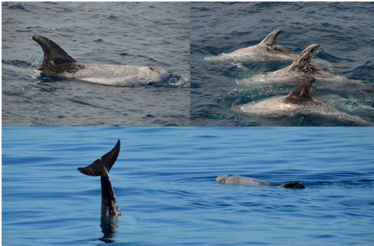
Figure 1: Morphology of Grampus griseus in photographs taken during the study and general aspect of the unpigmented scars presence.