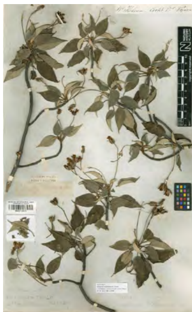
Figure 3. The type specimen of Trochetiopsis melanoxyloides collected by Joseph Banks and Daniel Solander on St Helena in 1771. The species is endemic to St Helena. It is globally extinct and the Banks and Solander type collection made in 1771 was the last collection of the species. There are two other species of Trochetiopsis endemic to St Helena: T. erythroxyloides is Extinct in the Wild and T. ebenus is Critically Endangered.

Writing on St Helena in the south Atlantic he commented that ‘Probably 100 St Helena plants have thus disappeared from the Systema Naturae since the first introduction of goats on the island.’ St Helena was uninhabited before the sixteenth century. Goats were introduced as a source of meat in the early 1500s and, as a result of its strategically important location, the island was colonised and became a major port of call for the British East India Company from the mid-1600s onwards. The introduction of large herbivores and invasive plant species and the harvesting of forests for timber brought about rapid and catastrophic changes to the native vegetation following the discovery and colonisation of the island (Cronk, 2000). Hooker’s estimate of the scale of species extinction may be an over-estimate but the St Helena flora has, undoubtedly, been hugely impacted by humans. Today, it is among the most threatened in the world with one quarter of the 35 recognised endemic flowering plant species considered globally extinct or extinct in the wild (Figure 3). The most recent extinction was of Nesiota elliptica Roxb. When Joseph Banks and Daniel Solander visited the island in 1771 during James Cook’s first