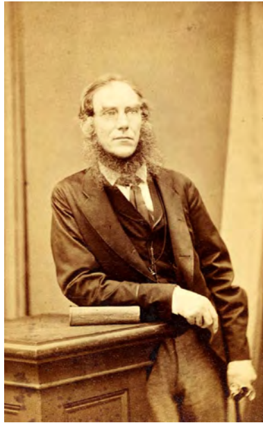
Figure 1. A photograph of Sir Joseph Dalton Hooker (1817-1911), taken in 1868, two years after his Insular Floras lecture.