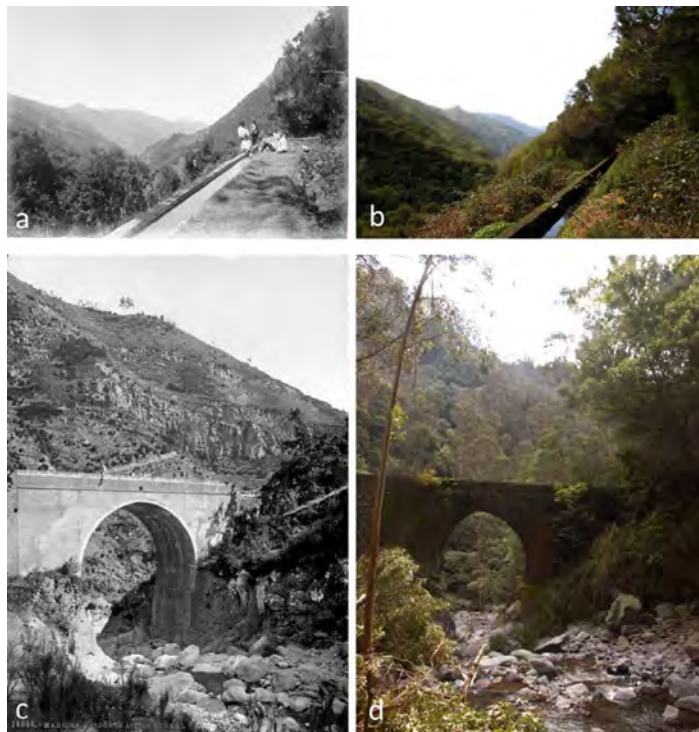
Figure 4. Repeat photography of Madeiran landscapes reveals the different fates of native vegetation through time. (a) and (b): Ribeira da Janela Valley. (a) Photograph taken by unknown photographer in the early twenty century showing large areas without vegetation cover forming clearings in a complex mosaic of forest and scrub. (b) Photograph taken in 2007 showing recovery of native vegetation in areas that were not covered in (a). The transition is to high-scrub or young forest with early secondary, shade intolerant species such as Myrica faya and Clethra arborea .

(c) and (d): Old Curral dos Romeiros or Curral pequeno. (c) Photograph taken by unknown photographer between 1876 and 1878 showing the lack of native forest; some native vegetation, mainly heather ( Erica platycodon subsp. maderincola ), is scattered in the landscape particularly in less accessible areas. The trees are exotic species (e.g. Sycamore ( Piatanus x hispanica ) and pine ( Pinus pinaster )). (d). Photograph taken in 2011 showing the increase of tree cover. However, unlike in (b), it is exclusively by exotic trees: Tasmanian Blue Gum ( Eucalyptus globulus ), Black wattle ( Acacia mearnsii ) and Sweet Pittosporum ( Pittosporum undulatum ).