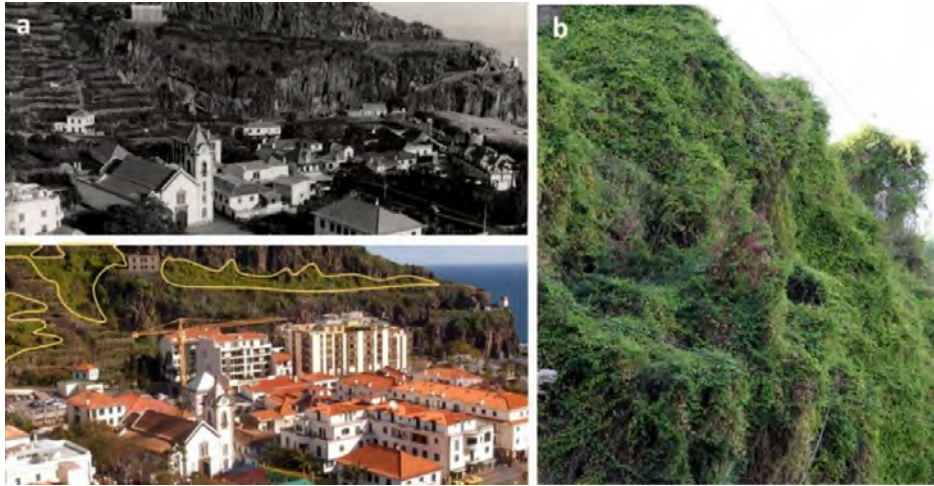
Figure 1. (a) Landscape zoom of historical and repeated landscape photographs taken in Ribeira Brava in early twenty century (by unknown photographer, ARM) and in 2010 (AP,MS), highlighted polygons correspond to areas were Cardiospermum grandiflorum Sw. was seen in current landscape; (b) A 'curtain infestation' of C. grandiflorum over a stream bank. Funchal, south coast, 2015 (AP).

Neither of the two species were identified in historical landscape, in accordance with the information about the time they were given as naturalised plants. C. grandiflorum and P. ricasoliana were the vines more often seen in photographed landscape (40/200, compared to 7/200 photographs showing all other naturalised vines). In the present landscape, they were more often detected in photographs of southern coastal regions (32, compared to 8 in the north coast) as the distribution referred by Short (1994) and Vieira (2002) i.e., mainly south coast up to 400 metres (a.s.l.). Results have shown that although the C. grandiflorum invaded different environments, it greatly overran lands that were no longer farmed, especially in southern areas (fig. 1a, 3), forming dense patches of balloon-vines growing together (fig. 1b). P. ricasoliana have shown major predominance in Funchal urban area where it grows profusely over the steep rocky banks of main streams crossing the valley (fig. 2b). On the north coast they were also seen rambling over abandoned terraces and native vegetation.