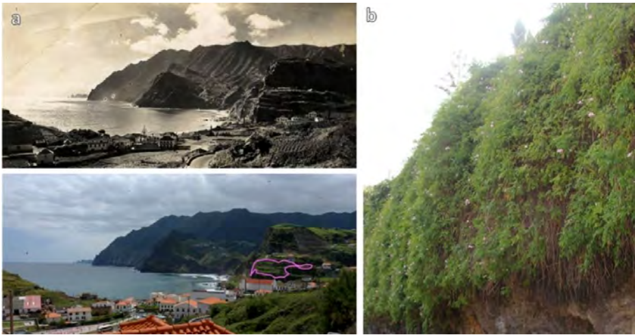
Figure 2. (a) Landscape zoom of historical and repeated landscape photographs taken in Porto da Cruz in early twenty century and in 2012, highlighted polygon correspond to the area were Podranea ricasoliana (Tanfani) Sprague was seen in current landscape; (b) P. ricasoliana which densely covers a cliff preventing any other vegetation growth. Funchal, 2015.

tation development for decades or completely change the direction of native forest succession (Paul and Yavitt 2010). In addition, C. grandiflorum is included in several lists of most invasive species, in Macaronesia as worldwide (Silva et al. 2008; Chapman et al. 2017), and P. ricasoliana was indicated as invasive species (HEAR 2013) as well. Although these two species were not assessed as dominant/moderate invaders in a comparison of plant invasions in 30 archipelagos all over the world (Kueffer et al. 2010), same study have shown that alien plants with invasive behavior in other islands are much more likely to become invasive than any other naturalised species. For these reasons, these two taxa must be taken as a major threat to native vegetation and biological diversity and ought be submitted to eradication and control, as it has been carried out in some other places where this smothering species it is also a hard-hitting invasive plant (Foxcroft et al. 2008; Foxcroft et al. 2013). However, up till now, no attempt was made to control them in Madeira Island (Silva et al. 2008).